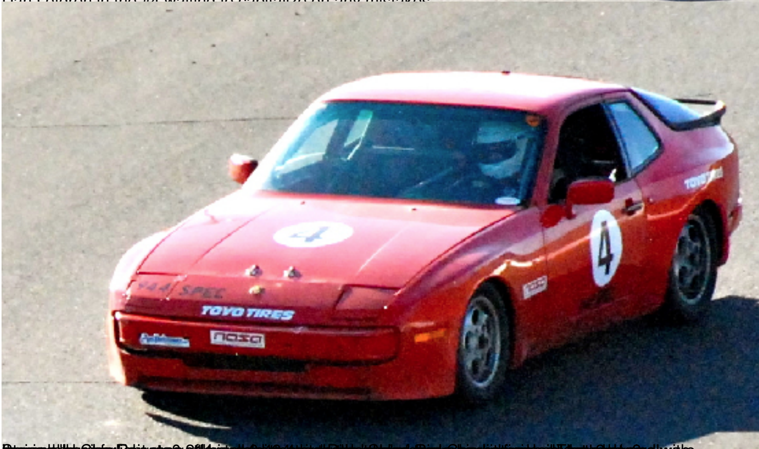
Driving Hill Climbing, Road Course, and Endurance races. Don Lofgren in the #4 waiting to capitalize on any mistakes